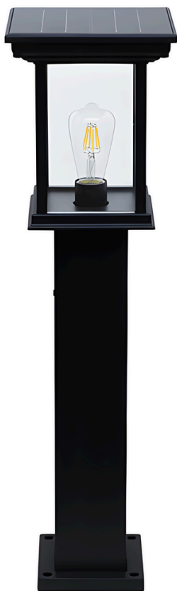
DIMENSION Unit: mm